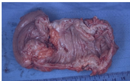
Figure 1: The deep endometriosis of rectosigmoid

dyschezia, tenesmus and pain during the defecation [1]. Rectosigmoid endometriosis is a disease that is of unknown pathogenesis and origin. After many years Sampson described rectosigmoid endometriosis as an ectopic implant of the menstrual cavity that is passed through the fallopian tubes into the abdominal cavity [2].