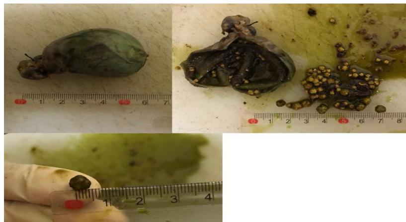
Figure 3: Patient's gallbladder and gallstones after cholecystectomy

The gallstones were then analyzed to know the stone composition. The results were the gallstones composed of cholesterol, carbonate, iron, and bile pigment. The gallstones analysis results did not describe the cholesterol content of gallstones, but based on the composition and the gallstones appearance we assumed the gallstones to be mixed stones.