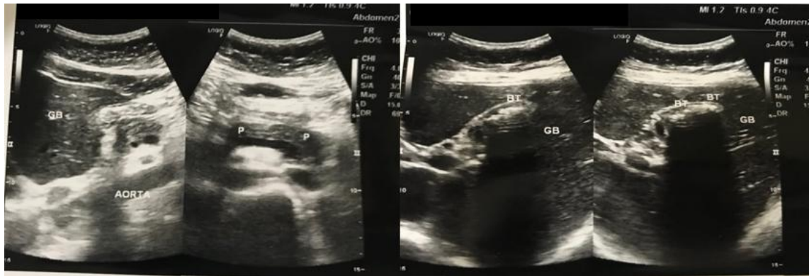
Figure 1: Abdominal Ultrasound